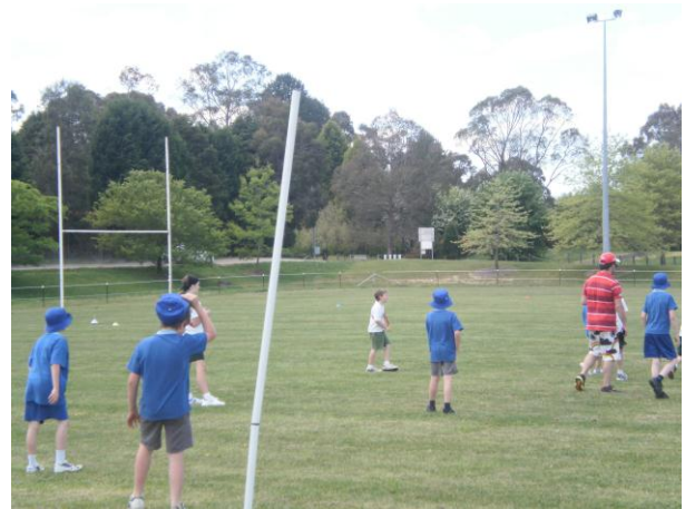
Time for a game...