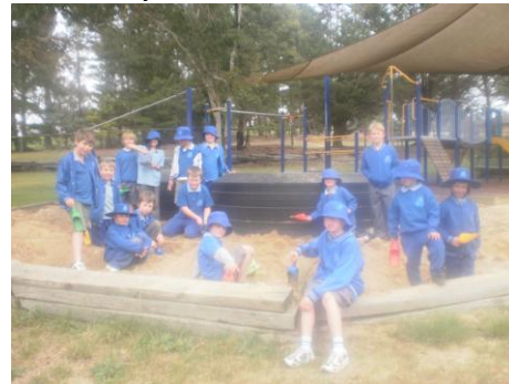
Having fun with the new sand toys