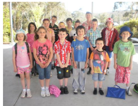
Loud Shirt Day