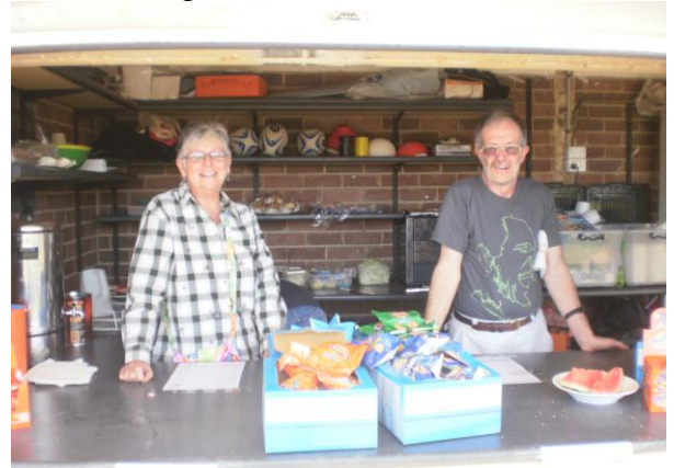
Manning the canteen....