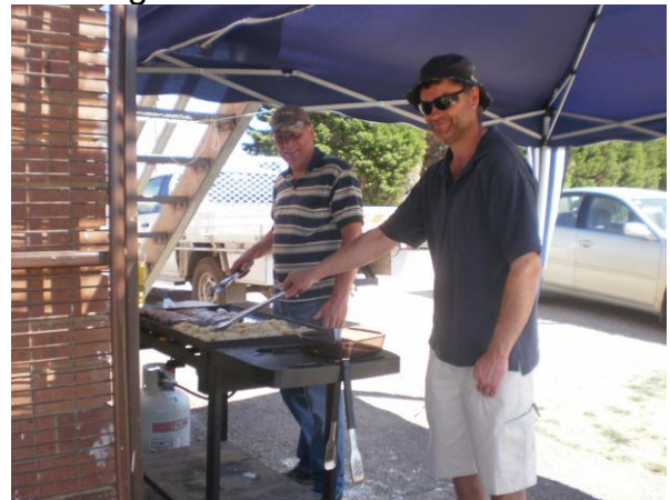
.....and the BBQ!