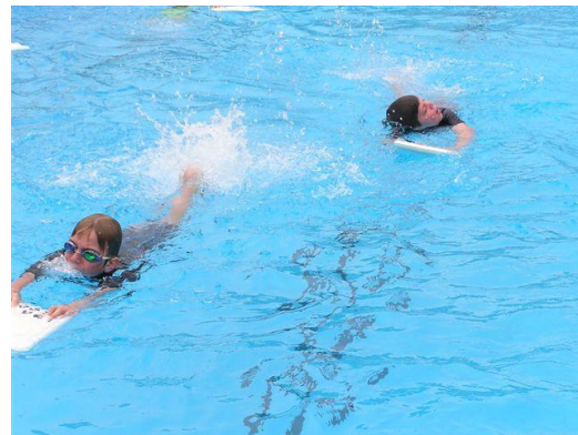
Students can bring some money to spend at the swimming pool canteen on Friday 9 th December as a treat for their consistent good behaviour throughout the fortnight of swimming.