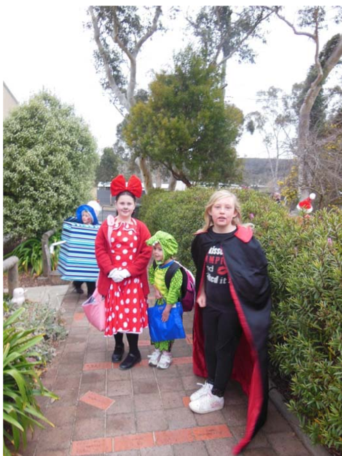
Colourful and creative