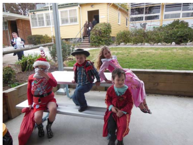
Term 3 Sport

Don't forget tennis on Fridays at a cost of $3 per student per week or $30 for the Term. Students can bring their own tennis racquets to school if they wish or the school has racquets for any child requiring one.