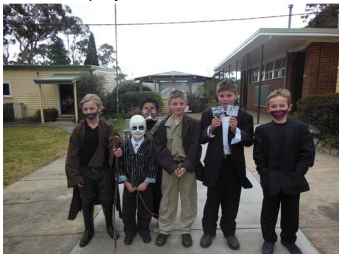
Adventure and fantasy

character. They enjoyed keeping in character for the rest of the day making for much imaginative recess and lunchtime play!