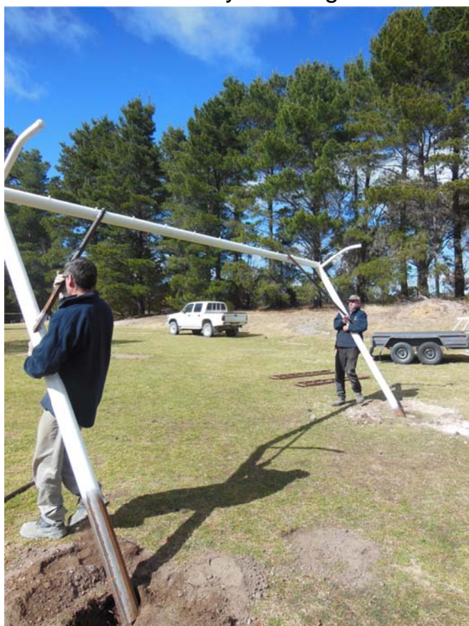
The goals at last!!