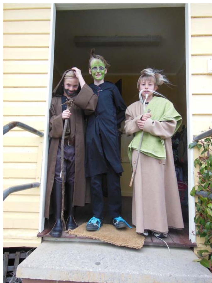
Heroes and villains