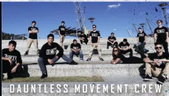
DAUNTLESS MOVEMENT CREW