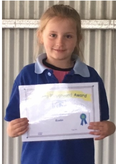
Playground Award - Koalas