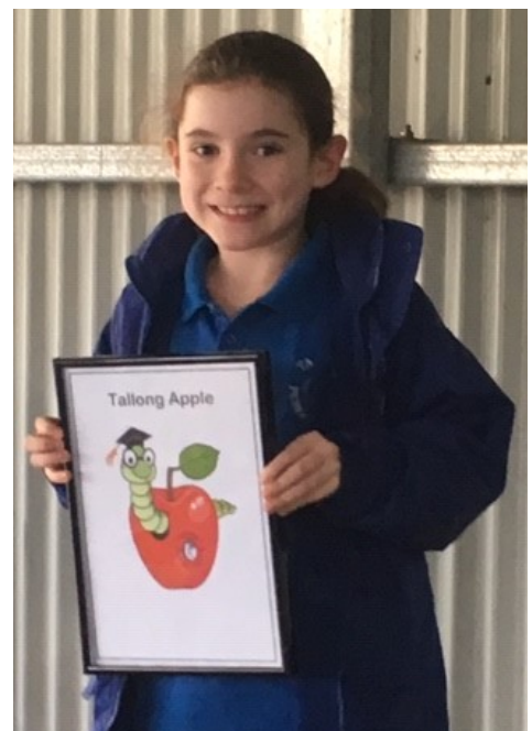
Winner of the 'Tallong Apple' Naming Competition