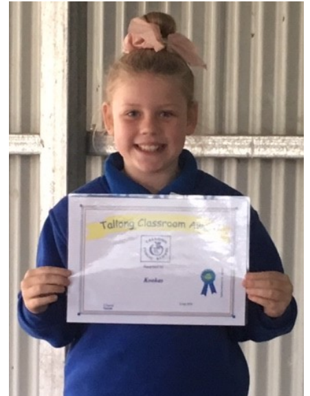
Classroom Award - Kookas