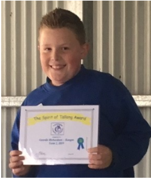
The Spirit of Tallong Award