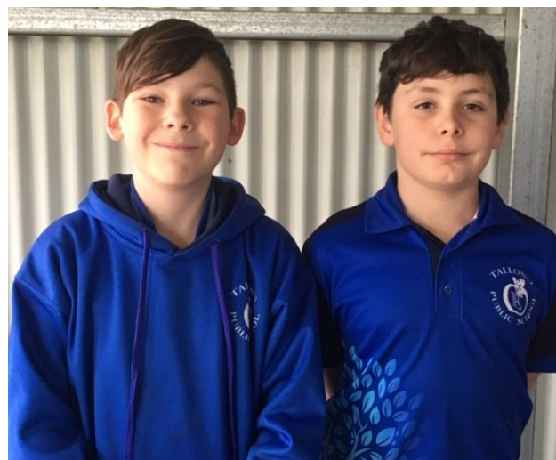
Assembly hosted by our Vice Captains