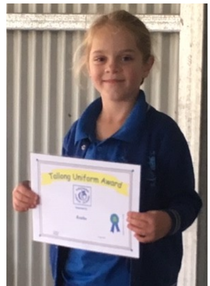
Uniform Award - Koalas