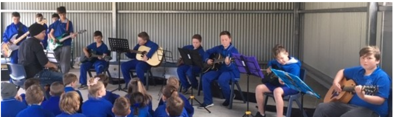
Tallong's Guitar Ensemble