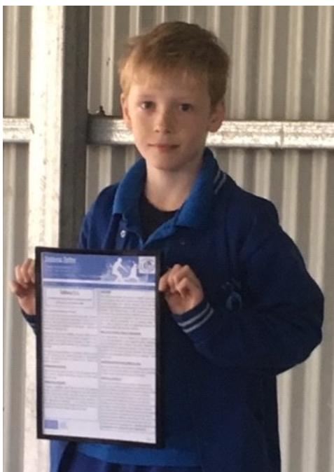
Winner of the 'Tallong Teller' Naming Competition