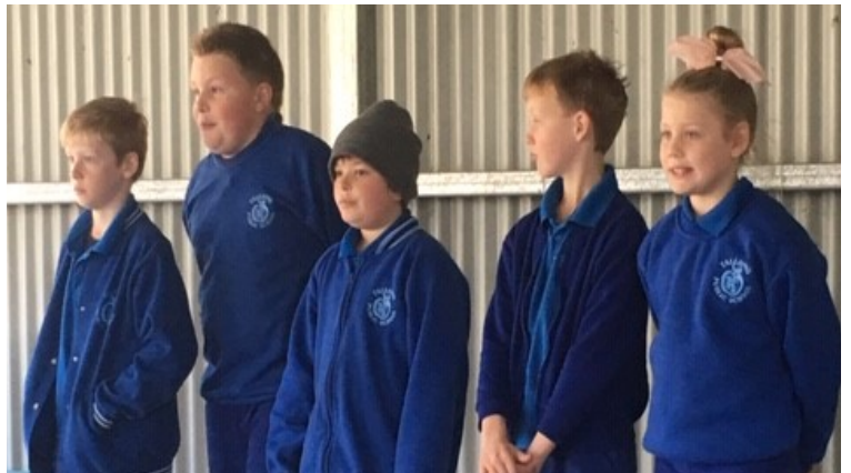
SRC - Student Representative Council