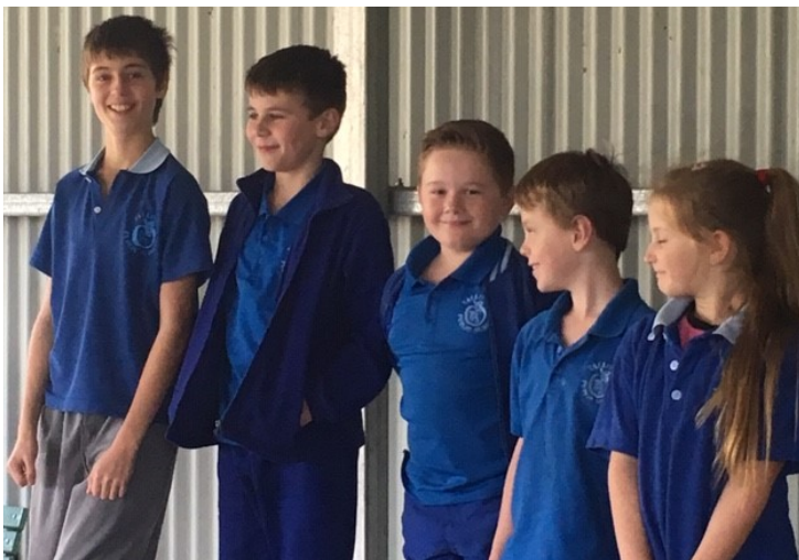
Principal Morning Tea Recipients