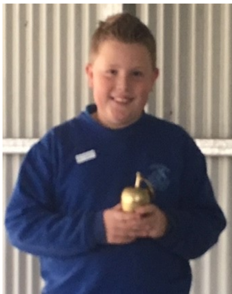
Golden Apple - KANGAS